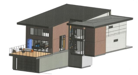
Type "F" 4,970 sq.ft.

If, however, the combination of use, density and setbacks is deemed necessary to achieve the low-density rural residential development designation then staff recommend that Council withhold the building permits for a further 60 days to allow the bylaw process to be completed. The policy contemplated by Council specifically indicates that "low-density rural residential" includes no more than one dwelling per parcel to a maximum size of 100m2, no ancillary commercial tourist