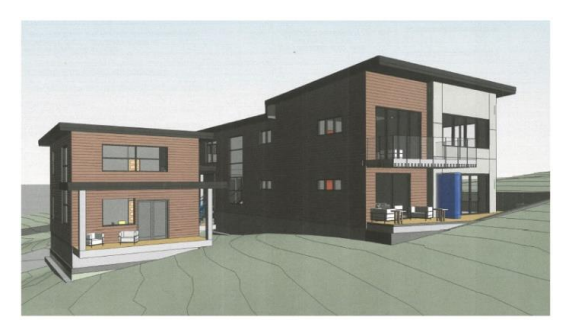
Type "D" 6,275 sq.ft.

Council may want to consider – if it wishes to grant the permits but impose conditions that would be in the public interest to achieve the intent of the new bylaws – whether any one or combination of the four areas of regulation above would be sufficient to satisfy the intent of the low-density rural residential