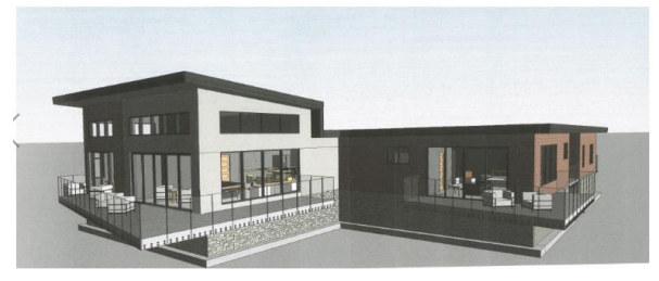
Type "C" 4,420 sq.ft.

compensation for damages arising from the withholding of the building permit. Council could also within the 60-day period grant the permits but impose