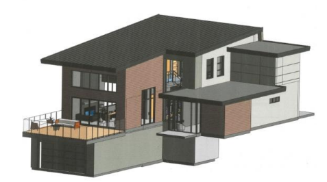
Type ''E" 4,920 sq.ft.

development designation that Council is contemplating in OCP amendment Bylaw No. 1292. In other words, would Council consider that these sites could be considered low density rural residential if the uses were strictly single-family residential (and therefore direct that the permits be issued but impose a condition that the secondary suites be removed from the plans)? Alternatively, would it be low density rural residential by just reducing the gross floor area or lot coverage, but still