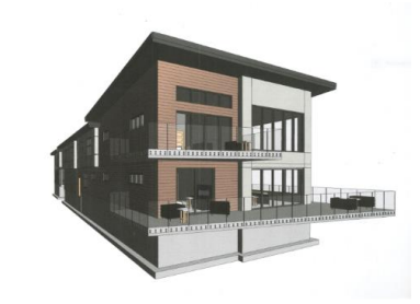
Type "B3" 6,415 sq.ft.

compensation for damages arising from the withholding of the building permit. Council could also within the 60-day period grant the permits but impose