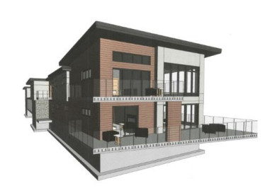
Type "B2" 6,250 sq.ft.